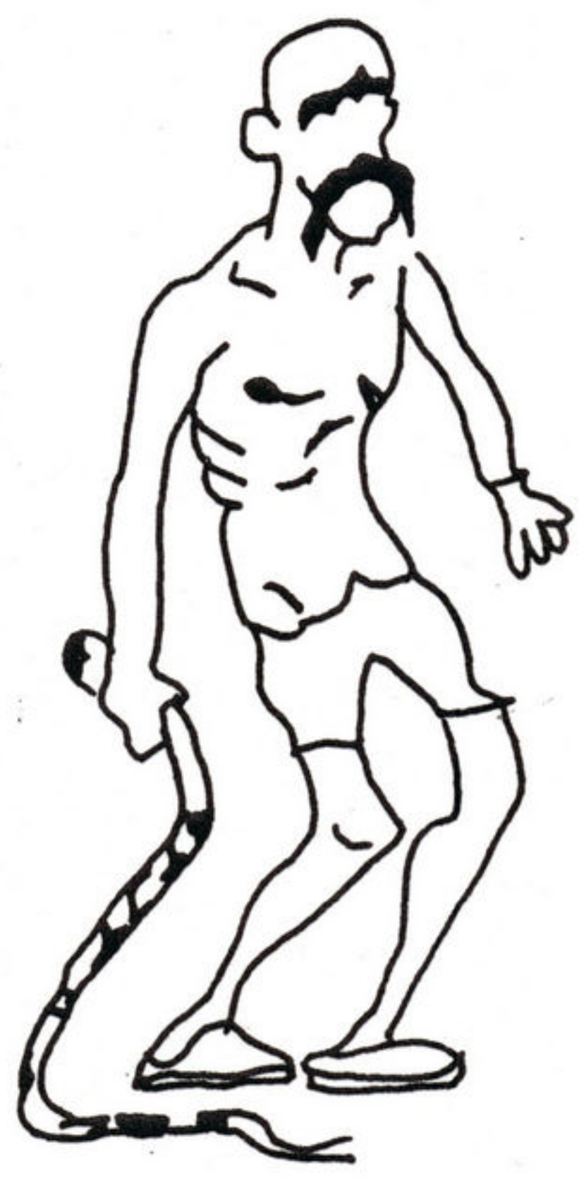
- 20% = WIP/WAP